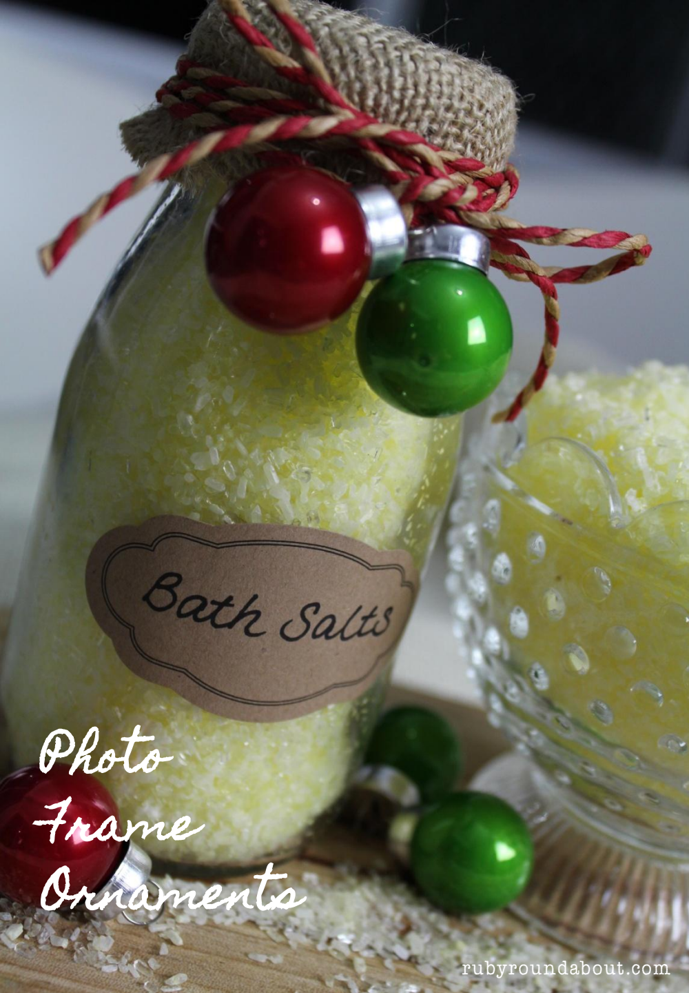
Photo Frame Ornaments

Really... it doesn't get any easier than Bath Salt, but the result is simply gorgeous. I tend to find myself forever grabbing the bottles for a quick sniff and a big hit of incredible fragrance. For this recipe, I chose to use Mandarin and Lavender pure essential oils because they are incredibly gentle on the skin and suitable for practically everybody. They are kind to sensitive skin and are relaxing and rejuvenating.